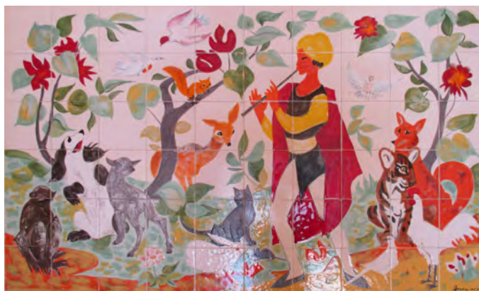
DEC_220 - The magic flute - Ceramic - 1978 - 90x150

Donation by Rezé city to Saint-Hilaire-de-Riez city.